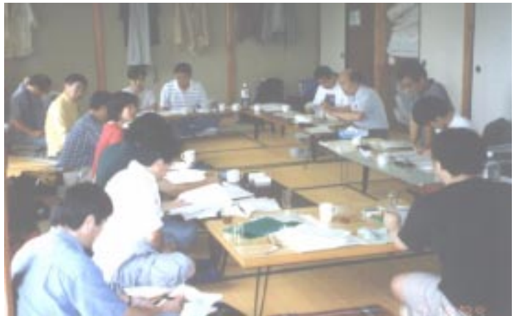
AGM of APWSL Japan held at Shiomi Church, Tokyo