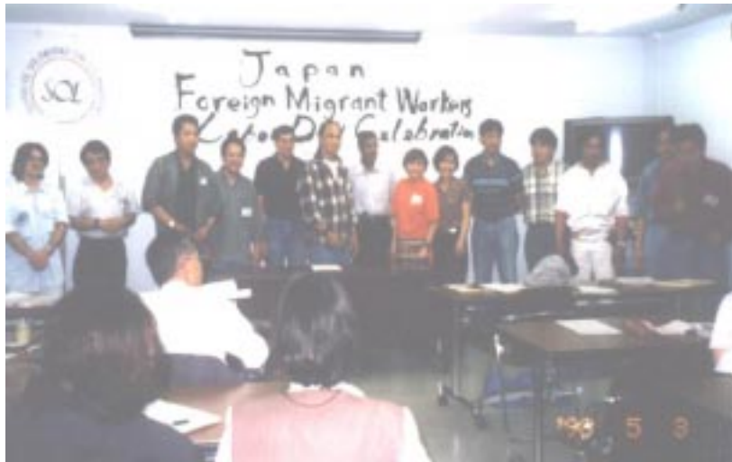
Migrant Workers Labor Day Celebration sponsored by SOL, May 3, 1998.

SOL was established in 1992 by the Catholic Diocese of Yokohama. One year before its establishment, the Diocese held an International Meeting in Asia for Social Action. The theme of this meeting was 'To seek a Church which lives with Migrant Workers'. Through this meeting, participants became aware the problems of migrant workers, and understood the need for a solidarity movement.