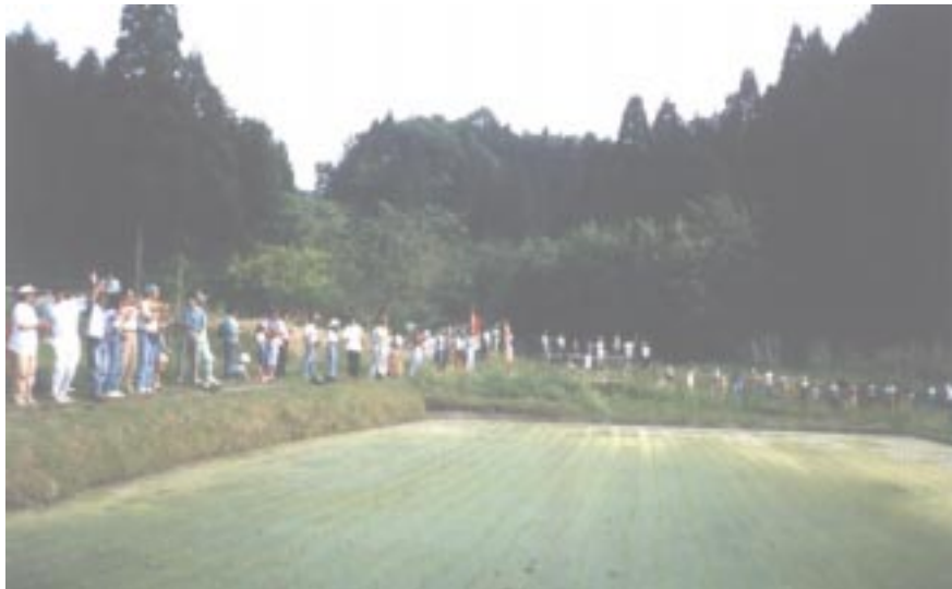
Human Chain against the World Expo in Aichi

The Tokai Region of the APWSL Japan Committee sends greetings of solidarity and a report of recent events. The Tokai region, where we live, consists of four prefectures, located along the Pacific coast around the middle of Honshu Island. I live in Aichi Prefecture, which is the commercial and industrial centre of the region. You may get a better idea if I describe it as the home town of Toyota. The car industry is one of the major industries in the Tokai Region, with Suzuki and Yamaha Motors here as well as Toyota. Honda and Mitsubishi Motors have their main factories in the region, too. I worked at Mitsubishi's Okazaki Factory until about two years ago. The Tokai Region is also the centre of the armaments industry, providing a production base for fighters, carriers, helicopters and various missiles for companies such as Mitsubishi Heavy Industry and Kawasaki Heavy Industry.