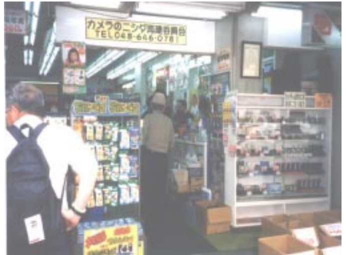
The main Entrance of Nishida Camera Shop, with a banner of the Rebuilding Committee

mission is not only to put the wage discrimination problem on the agenda but also to take initiative to change the male-dominated society, which the wage problem has ironically taught us about, starting from within our work places. One of the members of the movement says, "One of our roles is to drive a stake into male-oriented society. If the society utilizes female workers' abilities in a real sense, it should be a great benefit for the whole society as well as for companies. With this goal, we are going to eliminate gender biases in the workplace, such as wage discrimination. We believe that our movement leads to a realization of a society where the equal participation of both sexes is secured."