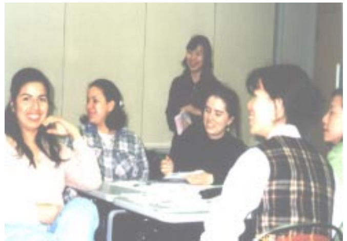
A workshop for the women's project of SOL about violence against women, 1 November 1, 1998.

I interviewed some staff members about the strong points and weak points of SOL for them. A young male staff said the atmosphere is comfortable for him because he has thought deeply about his identity as a Korean born in Japan. He had difficulty not being able to share his thinking with his friends. Since he started to work at SOL, he has felt at home. He enjoys to work with the staff members from other countries. A Filipina staff member said that now, due to the economic situation, human rights violations are more serious. Homeless women are increasing. She wants to work hard to solve their problems, and someday she would like to establish a migrant women's center in Japan. She said she hopes to solve also her own problems through this movement.