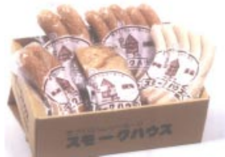
Sausages made and sold by dismissed National Railway Workers.

cured to retain the labor credits by staying 24 hours a day since the bankruptcy. In Japan, the occupation of a workplace to ensure credits is a first-come-first-serve basis. Their main business is developing, printing and enlarging and their skill has been highly appreciated by big film manufacturers. Also, they sell camera equipment, cellular phones, bags, and