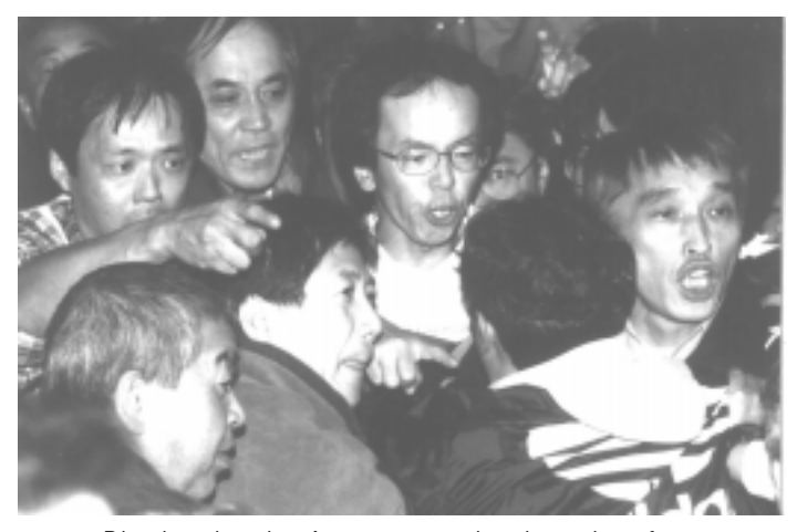
Dismissed workers' group protesting the voting of the progress report.