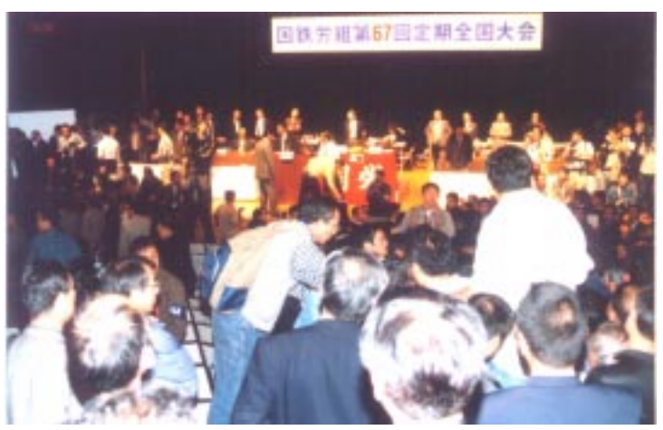
The 67<sup>th</sup> AGM of Kokuro held in Tokyo, October 28 – 29.