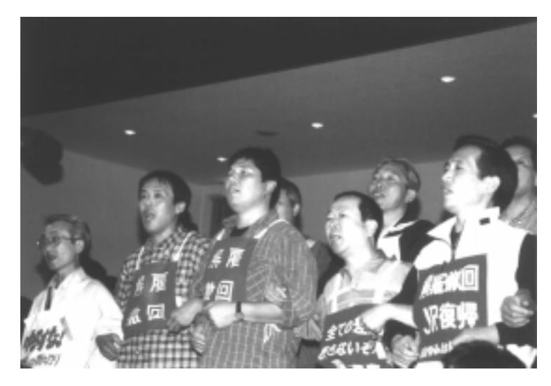
Dismissed workers and their families stand up to sing union songs during the AGM of Kokuro, October 29.

Another cause of confusion was the election of new executive committee members. The President had announced after the reopening meeting on August 26 that the executive committee would take responsibility for the confusion by resigning. But the executive committee stayed on in its positions till the AGM. So the issue was whether the former executive committee members could stand for the new committee. The del-